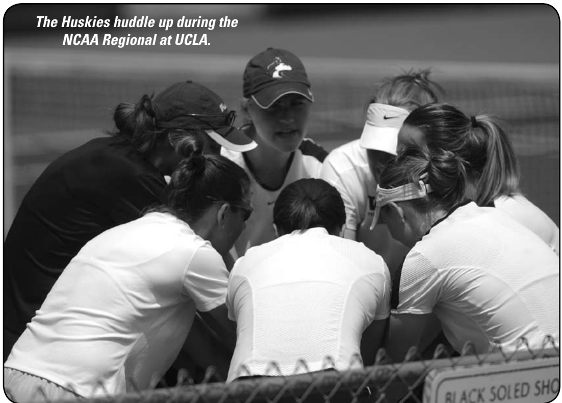
The Huskies huddle up during the NCAA Regional at UCLA.